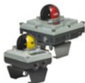
Limit Switch Enclosures

Pnecon Limit Switch are used for open & close feed back and are certified for Weatherproof IP 67, Explosion Proof IIC, T6 & Intrinsic Safe IIC, T6