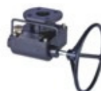
De Clutchable MOR

De Clutchable MOR is used to operate the valve manually in the event of Air Failure