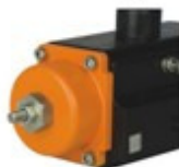
100% Travel Stopper

The stoppers are located in the end caps and allow the valve position to set anywhere between full closed to full open position